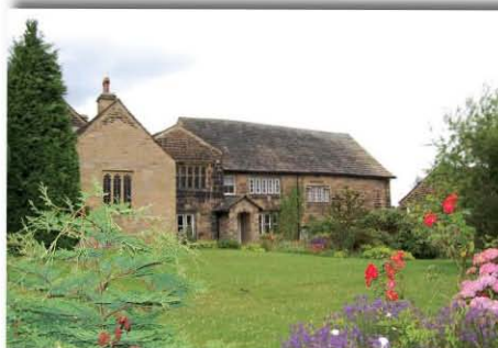
Calverley Old Hall