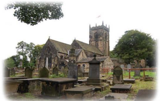
St Wilfrid's church