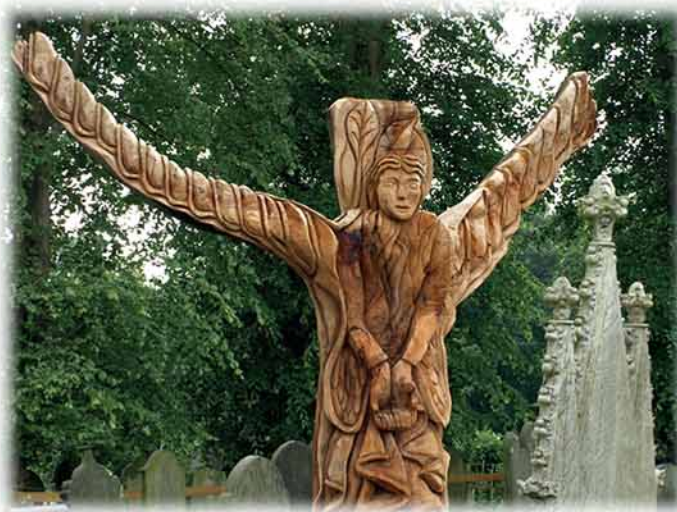
11 Calverley Angel