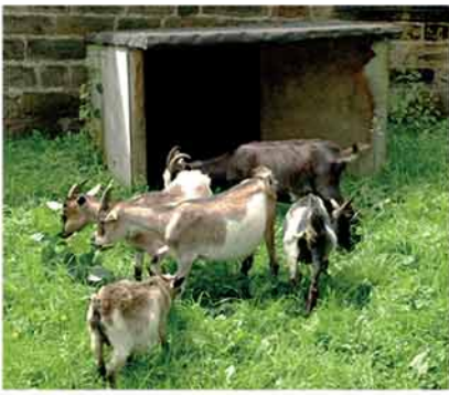
4 Foraging Goats