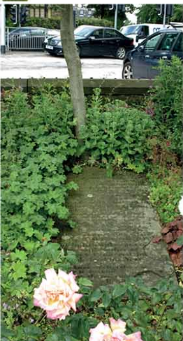
16 Miner's Grave