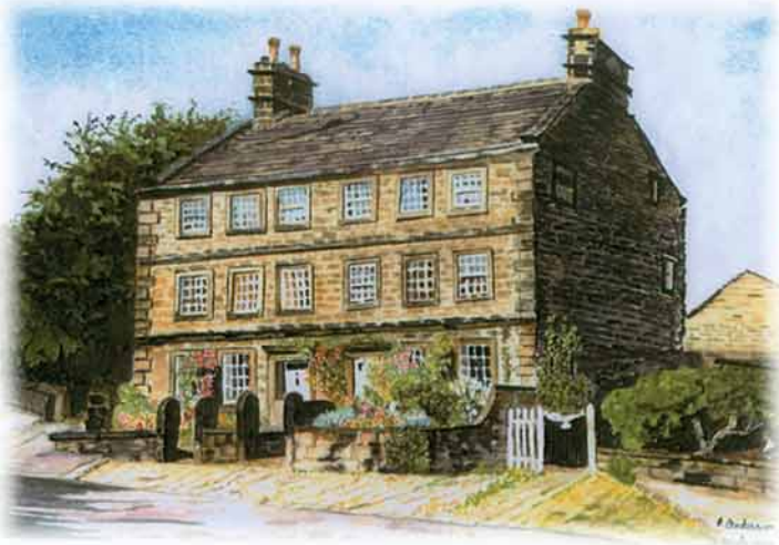
17 Town Gate