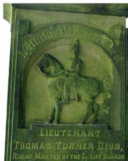
Guardsman on horse