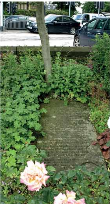
16 Miner's Grave