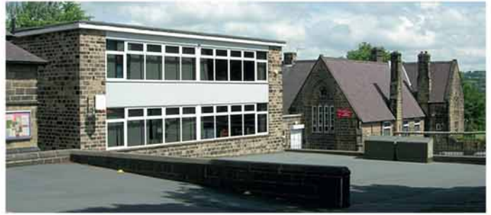
5 The Church School